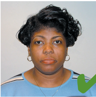
New Passport Style Photo